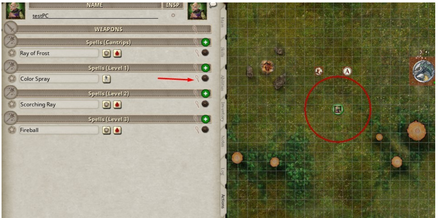
Example: Color Spray