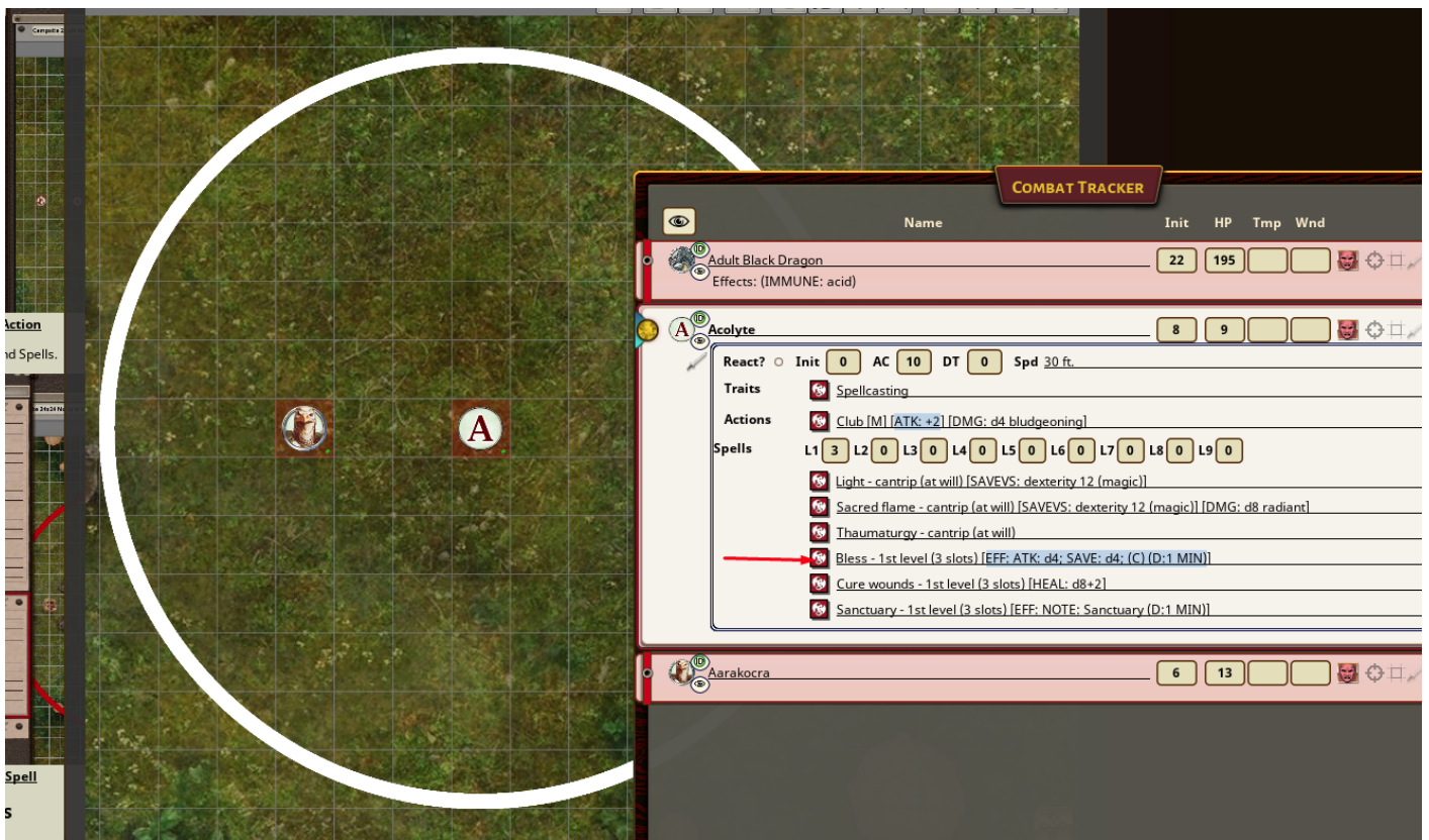
Mouse over NPC Spell