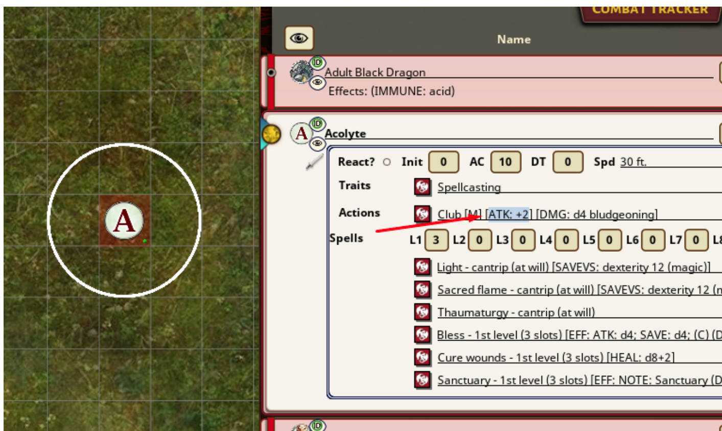
Mouse over NPC Action

The range indicator can be displayed by mousing over the power in the NPC's entry on the Combat Tracker. The threat range will be displayed for Actions, Bonus Actions, Legendary Actions, Lair Actions, and Spells. The drawn threat ranges will only be visible to the GM.