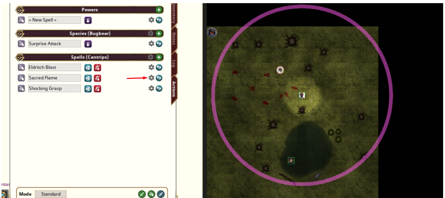
Example: Sacred Flame

The range indicator can be displayed by hovering the mouse cursor over the gear icon to the right of the spell or power in the PC's character sheet. They will only be visible locally, and is not visible on other players display. The PC must be in the combat tracker and added to a map from the combat tracker to work.